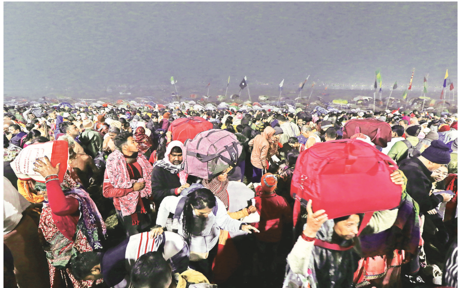
Devotees on the banks of Triveni Sangam at Maha Kumbh in Prayagraj on Monday.

The development came after Dhaka alleged that India was trying to construct fences at five locations along the India-Bangladesh border, violating a bilateral agreement.