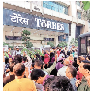
Investors gather outside the Torres Group Dadar office demanding justice.